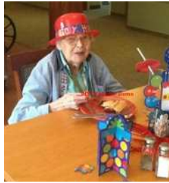
100 years young