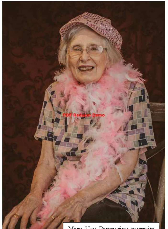
Mary Kay Pampering portraits

Check out www.amerymemorycare.com Or Find us on Facebook @memorycarepartners