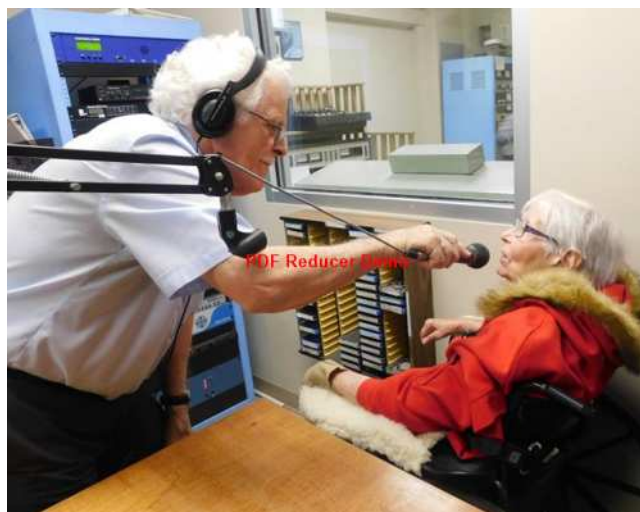
Field Trip to WPCA in Amery, WI