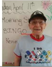
Best Bingo Caller Ever!!