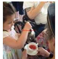
Mother's Day Tea