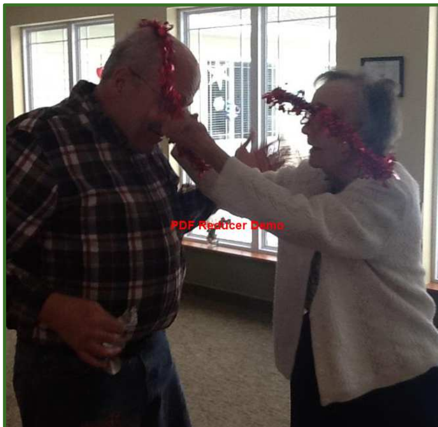
Alice never gets into trouble