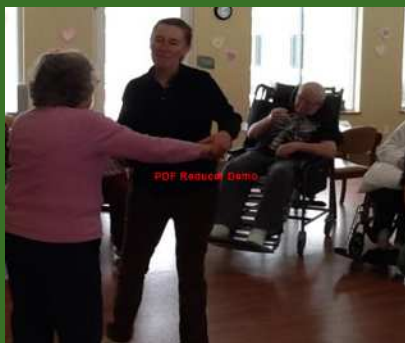
Little Falls Music Makers