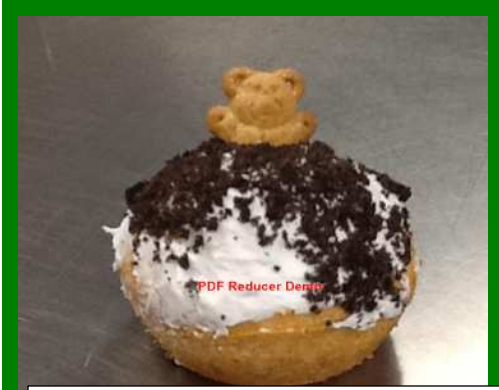
Delicious Ground Hog's Day treat from kitchen