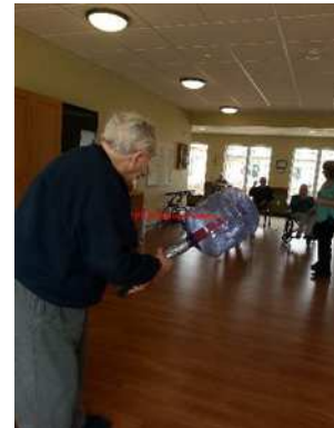
Our Boomball Superstars – watch out they can hit pretty hard.