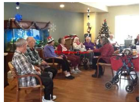
AMC Bell Choir