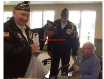
PDF Reducer Demo