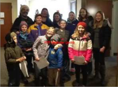
Congregational Church Carolers and presenters of warm fuzzy blankets