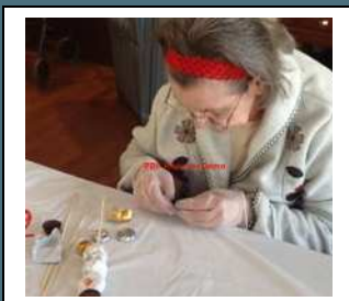
Baking Club – Snowman Kabobs