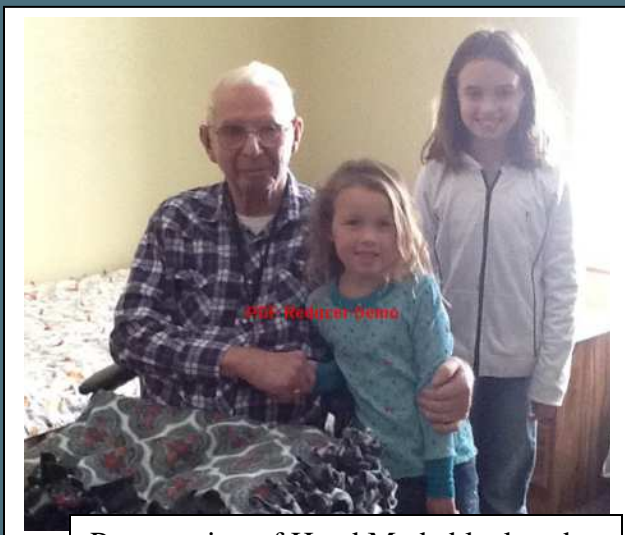
Presentation of Hand Made blankets by 4H Deronda Diplomats